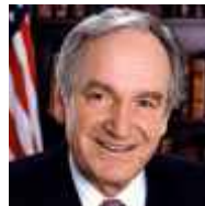
Senator Tom Harkin Chair