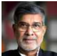
Kailash Satyarthi Founder