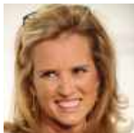
Kerry Kennedy President of Robert F. Kennedy Human Rights